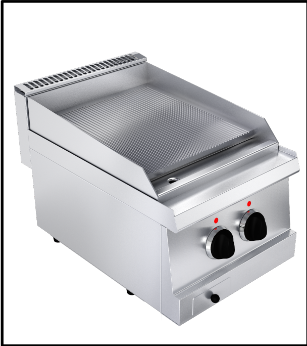
fry top fully ribbed 3,6 kW