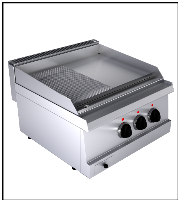
fry top smooth + fully ribbed 6 kW