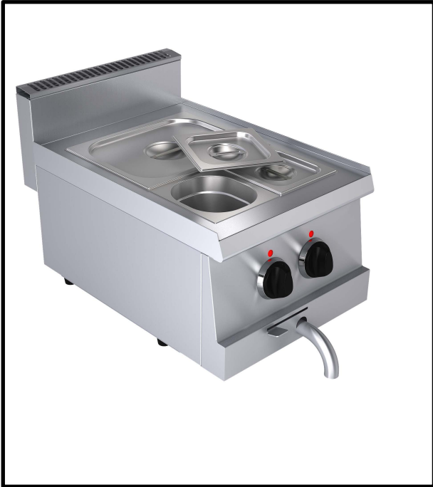
sauce bainmarie 1,5 kW