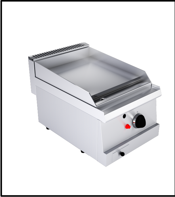
fry top smooth 6 kW